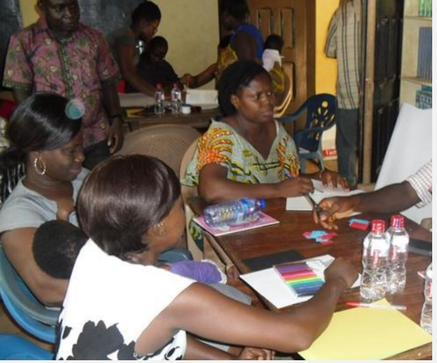
Mentors from partner schools of PWCE - Aburi preparing TLMs with low and no cost materials.

Role-play and the focus on using low/no cost materials and activity-based learning such as using cans, bottles, papers, bottle tops which are readily available to teach.