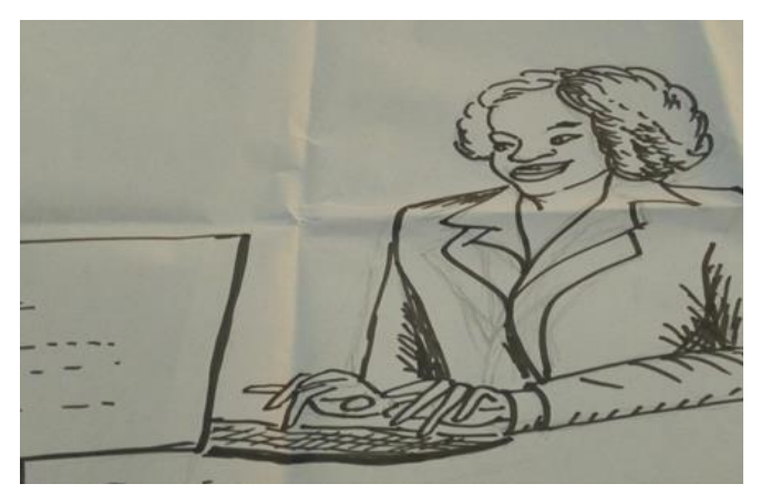
Picture 3: Using ICT to communicate from any location (St. Teresa's, Akatsi, and Peki)