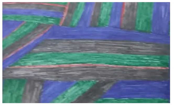
Picture 1: Pattern of ideas coming together and working in unity. (PWCE, Dambai and SDA).