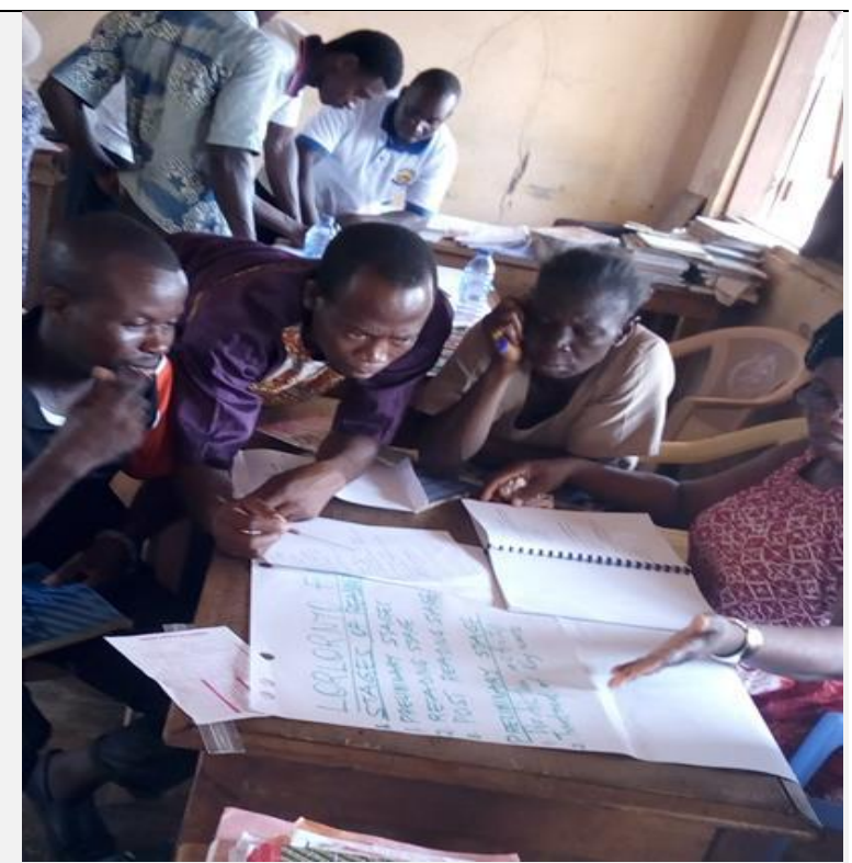
Capacity building workshop for mentors of Dambai College.

The achievement of the overall outcome was basically due to capacity building workshop held for EMS tutors on the development and use of digital animations in teaching.