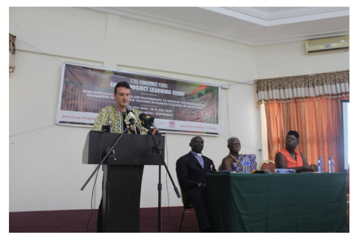
Mobilizing Local Resources and Partnerships to Improve the Professional Preparation of Pre-Service Teacher in Ghana's Colleges of Education

July 11 - 12, 2018 Capital View Hotel, Koforidua