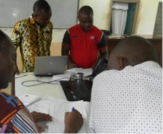
EMS tutors of Jasikan College engaged in group work during training workshop