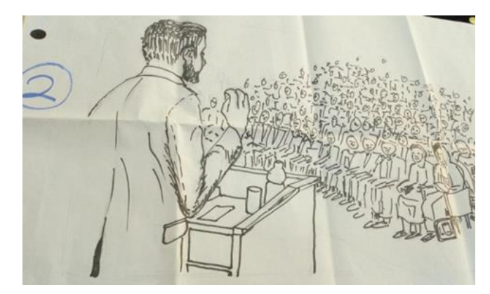
Picture 2: Relationship building and sharing information with a large audience. (Peki, E. P. College, Amedzofe and St. Francis, Jasikan).